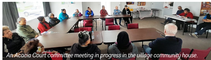
An Acacia Court committee meeting in progress in the village community house.

Tenants of Papatoetoe's Acacia Court have recently formed a committee to support one another and to encourage various joint activities. One such activity was a village BBQ which was held on 27 September and funded from proceeds raised from the raffles that are also sold at the village. What an awesome good neighbour initiative!