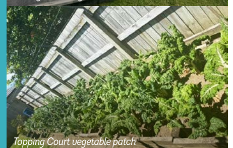
Topping Court vegetable patch