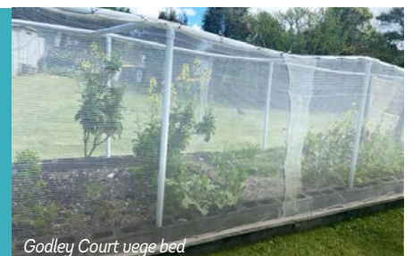
Godley Court vege bed

Tenants of Topping Court in Māngere East and Green Bay's Godley Court are reaping the benefits of their green-fingered efforts, with their veggie gardens now producing plentiful produce for everyone to share. In each village, tenants work cohesively throughout the year in the upkeep of their communal vegetable patches, with everyone helping out with the various gardening, planting and weeding chores and doing their bit to nurture the developing harvest. They all agree that working toward this common goal encourages connection, friendship and neighbourliness in the spirit of 'whanaungatanga'. When the fresh crop of vegetables is ready to be picked, they're distributed amongst the village community, with tenants then enjoying a shared meal together. What a fantastic, inclusive initiative for the benefit of all!