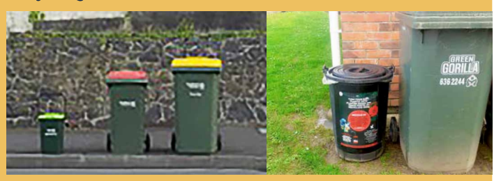
Guide to the correct bin to use. From left, food scraps, general waste, recycling, soft plastics, garden waste.

For further information on the 'do's and don'ts', visit: recycling.kiwi.nz