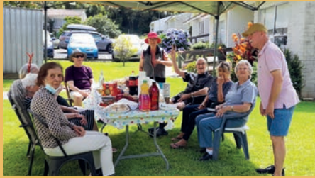
Peggy Phillips Village, Takapuna

Christmas may seem a long time ago now, but we still have fond memories of the lovely shared lunches that were held around the villages to celebrate the festive season.