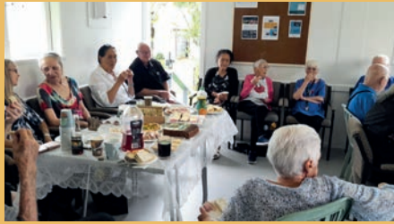
Kaumatua Court, Te Atatu