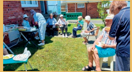
Dallington Court, Mitford