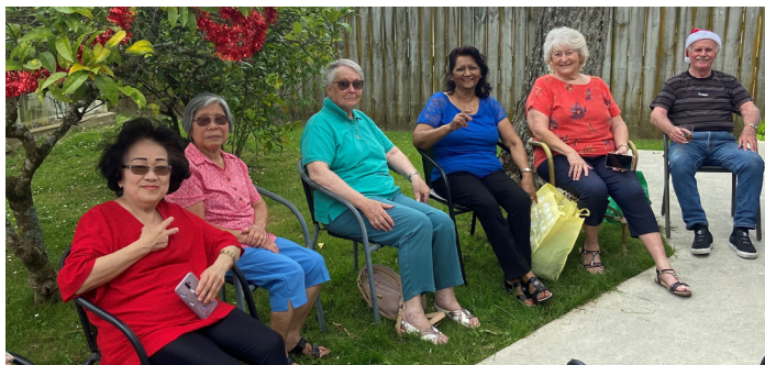
Glenfield's Bentley Court tenants enjoyed their Christmas party in the garden.