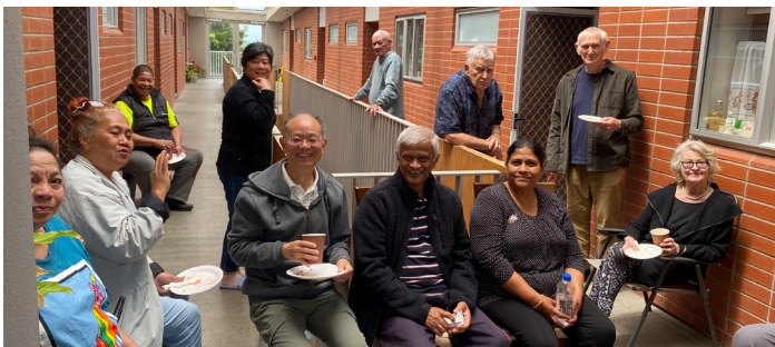
Tenants of Manurewa's Gallaher and Alfriston Courts didn't let wet weather dampen their spirits - they enjoyed their combined get-together inside the Gallaher building