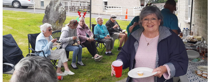
Despite some windy weather, tenants of Takapuna's Peggy Phillips Village enjoyed their festivities out-of-doors.