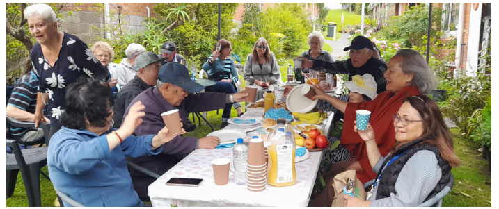
An overcast day didn't stop Birkdale Court tenants from partying.