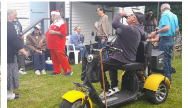
Te Atatu's Kaumatua Court even hosted Santa on his motorcycle!