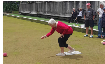
Shepherd's Park tenants had a great Christmas outing playing bowls and feasting at the nearby Beach Haven bowling club.